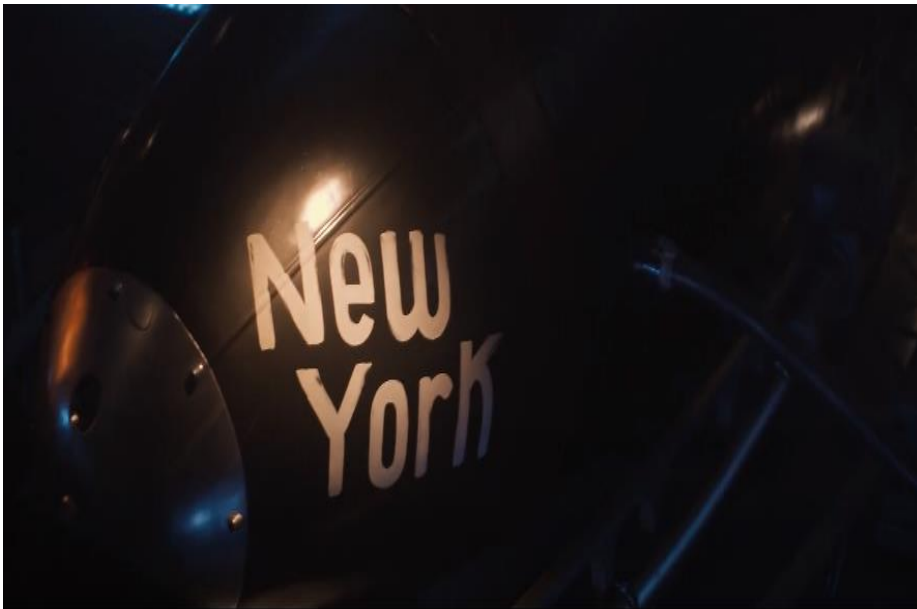
Figure 4. High Camera Angle Shot of New York's Bomb

He then uses another high-angle shot to show another bomb with the label New York (see Figure 4). 46 The camera angle focuses on the New York bomb more than the other two because it is more important for Captain America since he is from Brooklyn, New York. This scene is accompanied by tense and threatening music, which makes the situation very dangerous. Figure 4 can be seen as a direct link to the events of 9/11: in reality, the 9/11 attacks were a series of airline hijackings and suicide attacks carried out by a terrorist organization called Al Qaeda, whereas, in the movie The Red Skull planned a series of aerial suicide attacks on different U.S. cities starting with Boston, Chicago, and New York. The difference between real and imagined events is that the enemy succeeded in their attacks. At the same time, in the movie, Captain America manages to save the cities and especially New York, by sacrificing his life for the greater good of the American people.