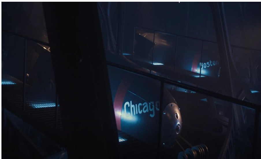
Figure 3. The High Camera Angle of Chicago and Boston's bombs

Captain America: The First Avenger (2011) contains visual elements connoting the 9/11 attacks, like the airplane, New York City, and an archvillain. This part focuses on the camera movements and the visual elements relevant to the current hypothesis. Camera angles affect the messages the director wants to deliver to the audience. In this scene, the camera moves in a way to show the three bombs differently: the film director Joe Johnston uses a high camera angle when showing both the bombs with the labels Chicago and Boston next to each other within the same frame to diminish and make the object less important (as shown in Figure 3). 45