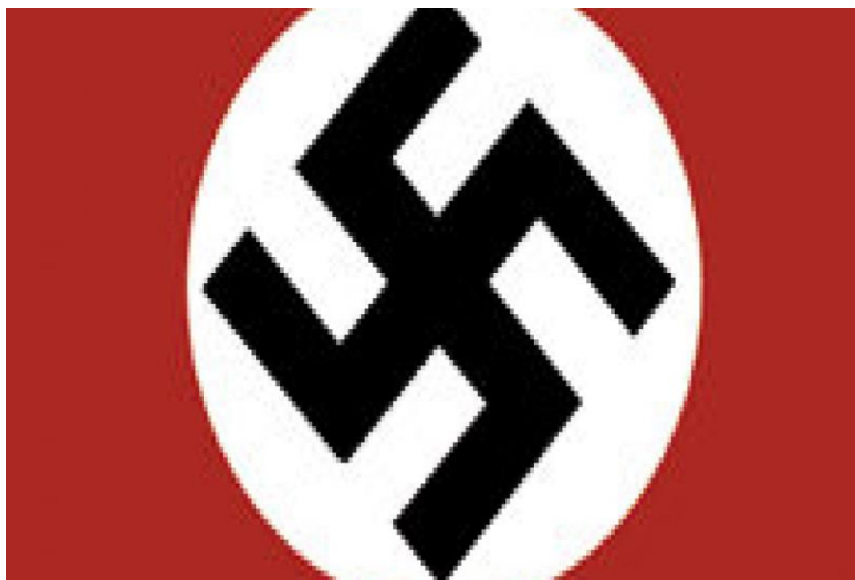
Figure 2. German Swastika Flag

By possessing these characteristics, Schmidt is now the symbol of death and every evil on earth. He represents anarchy, fascism, and the ultimate foil of Captain America's principles of democracy and freedom. Since Captain America's Star-Spangled Costume with red, white, and blue colors represents the U.S. flag and signifies loyalty to American values, the Red Skull's redhead represents nihilistic intentions to seek bloodlust at the cost of democracy for the sake of power. He also symbolizes dictatorship since he considers people enslaved and rules as he wishes without restrictions.