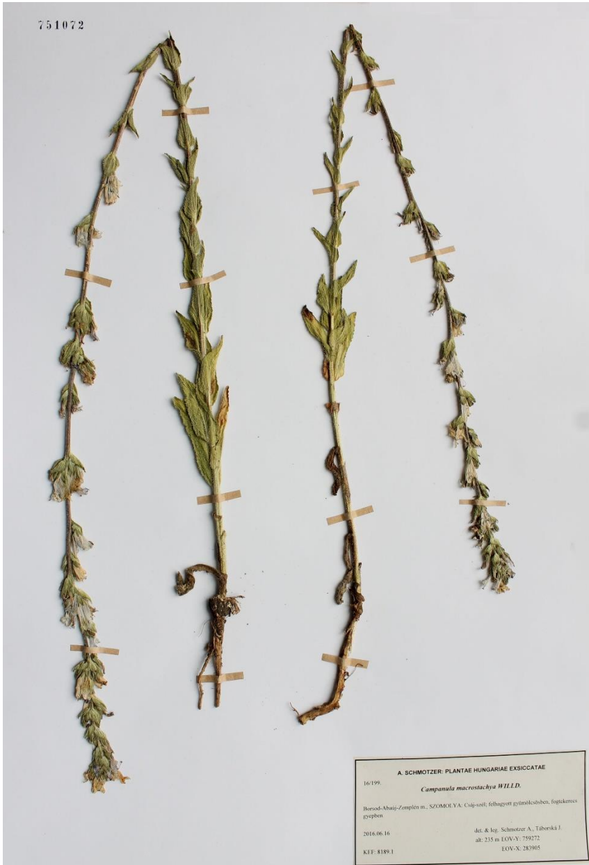
Figure 2. Voucher specimen of Campanula macrostachya (ID number: BP7510721).