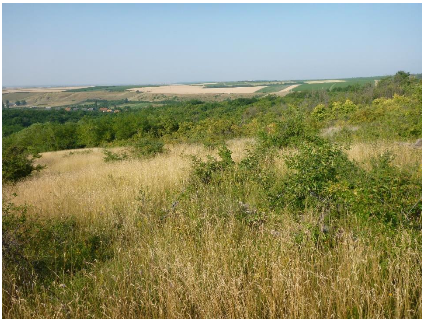
Figure 3. Habitat of Campanula macrostachya at village of Szomolya village (7 July 2015).

locality, but also take part in the natural regeneration phase in secondary succession (Baráth 1963).