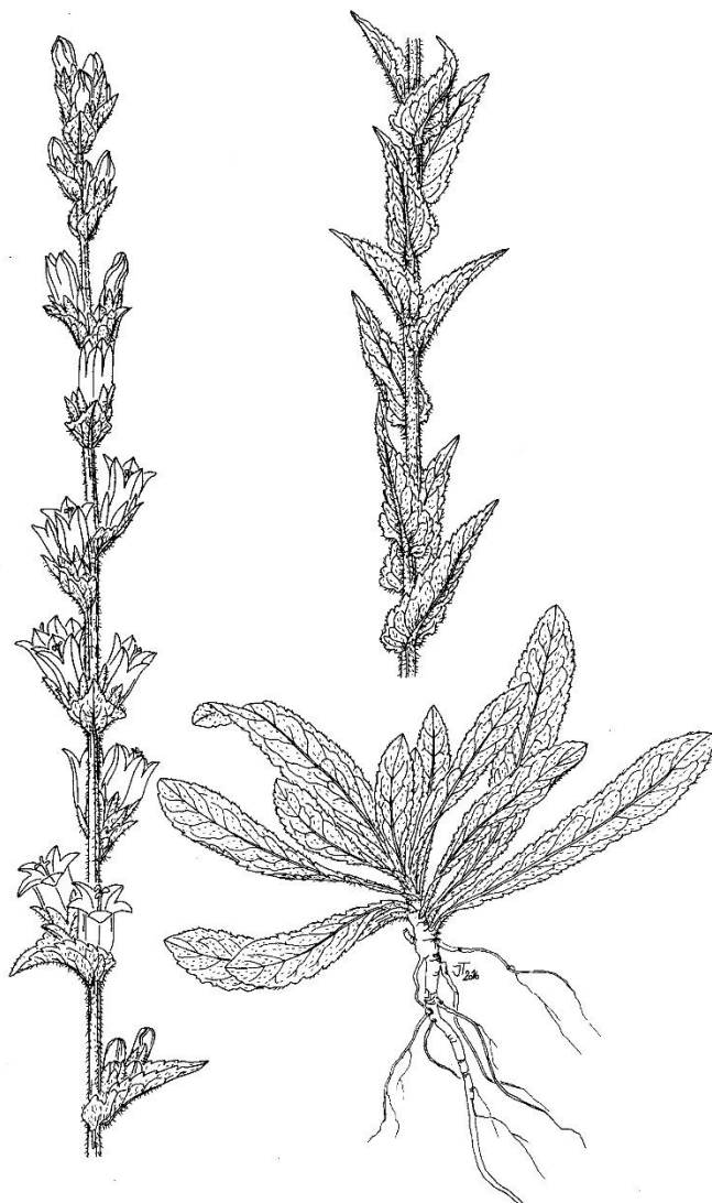
Figure 1. Campanula macrostachya Waldst. & Kit. ex Willd. (drawn by J. Tábořská).

karyological data on tetraploid populations occurring in Hungary (2n=32; locality: Visegrád Mts.) were reported by Michalková (2007).