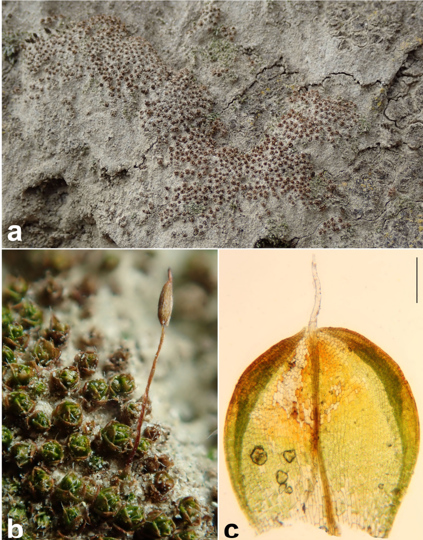
Figure 3. Hilpertia velenovskyi . a. hundreds of sterile shoots forming characteristic herd like groups on the loess cliff near Csákberény, b. habit with a sporophyte on the loess cliff near Lovasberény, c. leaf with the characteristic strongly recurved margins (CSN 11360). Scale bar = 20 \mu\text{m}.

Since the vast majority of H. velenovskyi populations in Europe can be found in the Hungarian part of the Carpathian Basin, Hungary holds the highest responsibility for the conservation of this species.