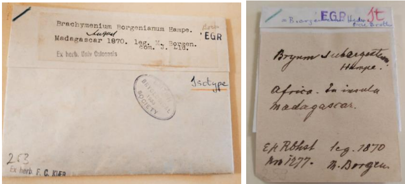
Figure 1. Isotypes of Brachymenium borgenium Hampe and Bryum subargenteum Hampe, the oldest specimens collected from Madagascar, held in Eger.

The Malagasy specimens of EGR under study were collected between 1870 and 2018. The intensity of collecting was very uneven, as the vast majority of specimens were obtained between 1990–1999. The collection of the specimens from Madagascar can be dated from the first half of the 1990's and from 2004, when travel and financial conditions made this possible. Professor Tamás Pócs participated in altogether four times (1990, 1994, 1998, 2004), members of the Botanical Department accompanied him once time and collected on the 1994 Madagascar research trip. Before and after this period, materials were sent to our herbarium mainly by gift or exchange. In 2018, another opportunity was opened to collect moss on the island on behalf of the French Museum of Natural History, this time by Andrea Sass-Gyarmati in the frame of „Madbryo” Project. A decade-long breakdown shows that most of the samples, numerically 1520, came from the period 1990–1999 (Figure 2).