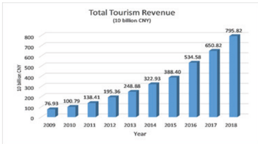
Table 1. Total Tourism Revenue from 2009 to 2018

The beautiful natural scenery, many historical and cultural monuments, rich ancient customs in Dali to become the Yunnan province tourism industry started one of the first regions. Since the 1980s to the late 1990s, Dali tourism industry has been rapid development, has become a popular tourist destination in Yunnan province city.