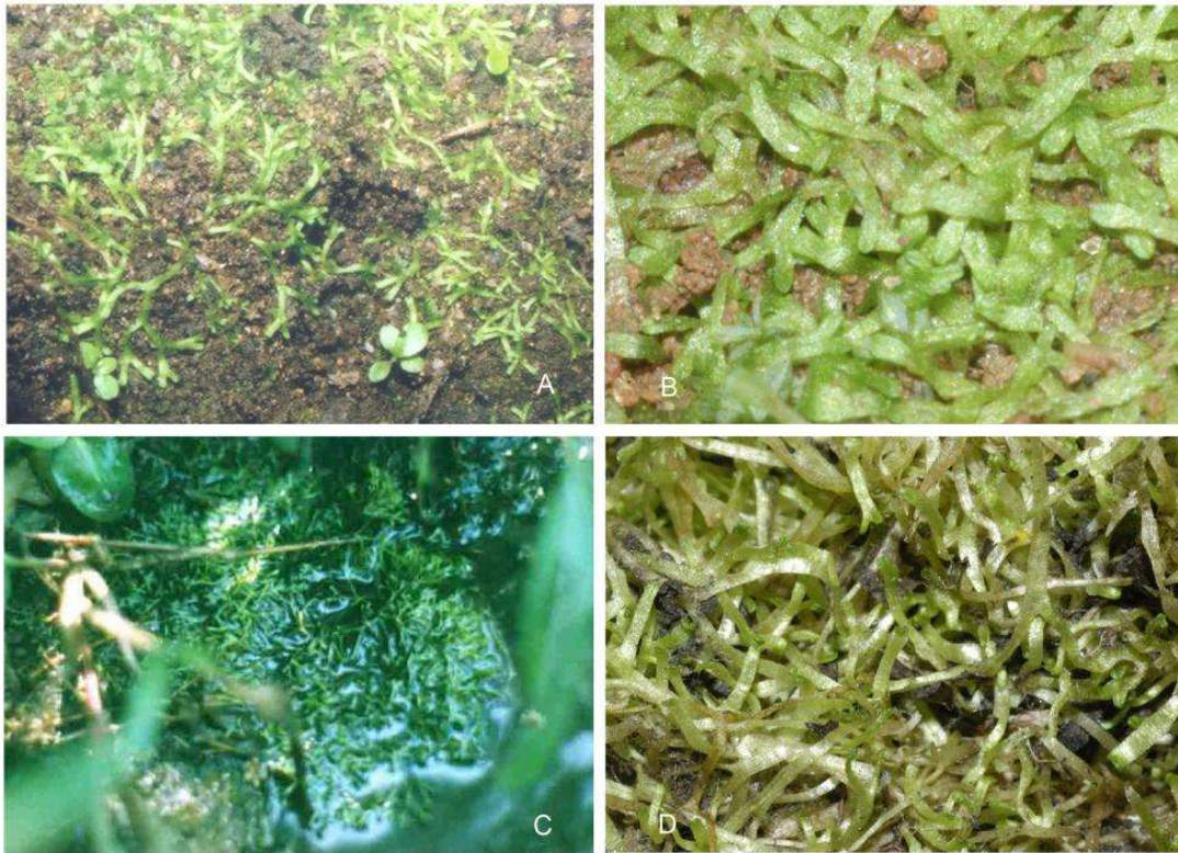
Figure 1. Riccia stricta specimens collected from different localities of Western Ghats, A: KPR 106927 (terricolous). B: MCN 84369 (terricolous). C: MCN 84511 (aquatic). D: KPR 99809 (aquatic).

Riccia fluitans auct. mult. non L., Species Plantarum 1139. 1753; emend K.Mueller, Aufl. 6 Bd. 1. Abt. 204. f. 134. 1907. Ricciella fluitans (L.) A.Braun, Species Plantarum 1139. 1753. Riccia canaliculata Hoffm., Deutsch. Fl. 2: 96. 1795. R. canaliculata Hoffm. var. fluitans Schiffn., Oester. Bot. Zeitsch. 49: 387. 1899. Riccia duplex Lorb. & K.Mueller, Hedwigia 80: 100. 1941. Riccia media Klingm., Flora 146: 616. 1958.