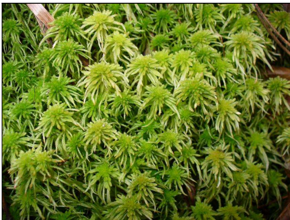
Fig. 1. The Sphagnum quinquefarium in the Ilona Valley of the Mátra Mountains in Northeast-Hungary